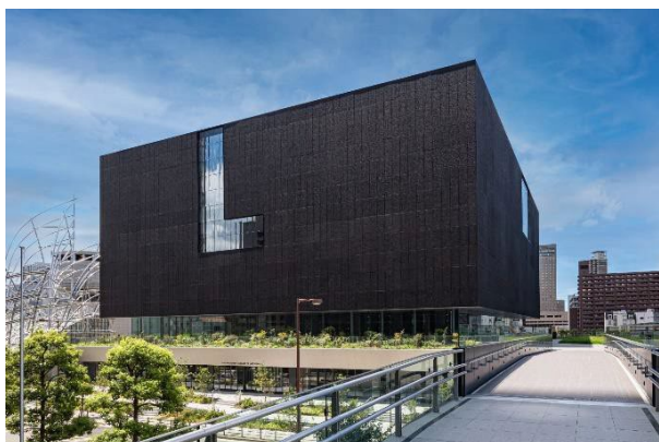
Nakanoshima Museum of Art, Osaka