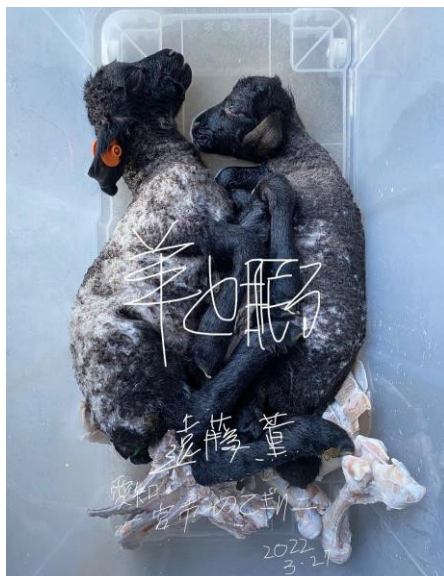
Kaori Endo, sheep and sleep , 2022, sheepskin, wool, and other materials.