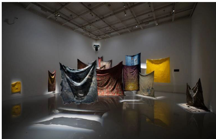
Kaori Endo, Gravity and Rainbow , 2019. Photo: Ken Kato. Courtesy of Shiseido Gallery ( The 13th shiseido art egg ).