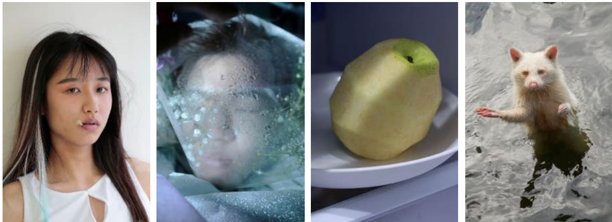
From left: Non-Human , 2021; Don't touch the flowers , 2020; Did you think I couldn't see? , 2021; Comprehension Bookstore proprietor M , 2017.