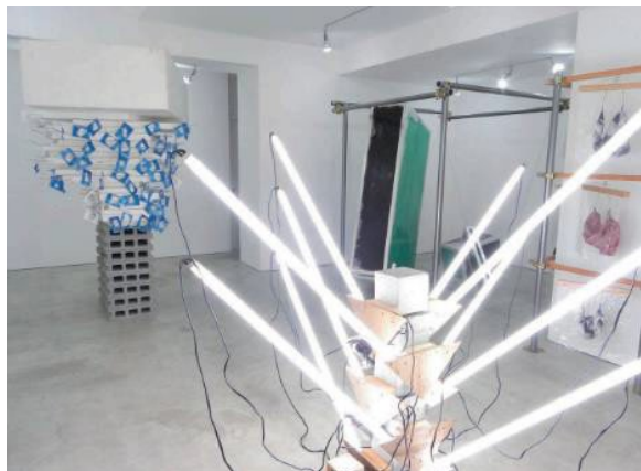
Backronym , 2010.