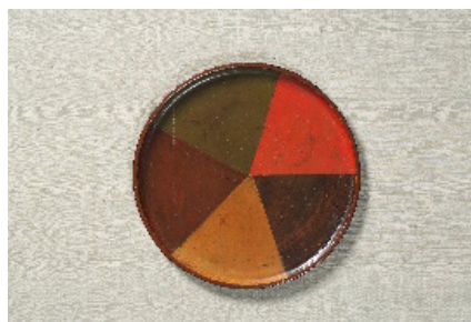
From left: Haori coat with design of Japanese chess pieces , Edo period, nineteenth century / Candlestand , Edo period, nineteenth century, brass / Tray, multi-colored , Edo period, eighteenth century / All works are from The Japan Folk Crafts Museum.