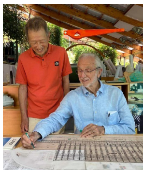
Susumu Shingu and Renzo Piano in Genoa in 2022 at RPBW.