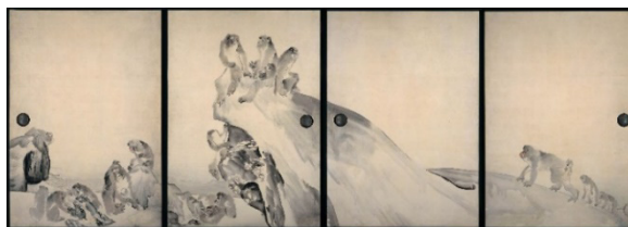
From left: Tiger on fusuma panels (partial) (Important Cultural Property), Kushimoto Okyo Rosetsu Art Museum at Muryoji Temple / Monkeys on fusuma panels (partial) (Important Cultural Property), Daijōji Temple / All works are by NAGASAWA Rosetsu.