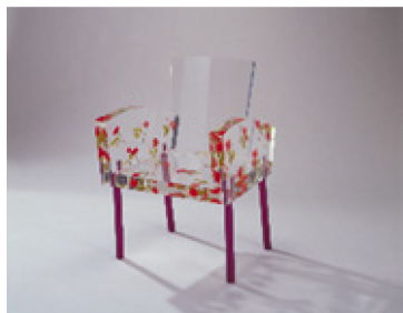
KURAMATA Shiro, Miss Blanche , designed 1988, produced 1989, Nakanoshima Museum of Art, Osaka. ©Kuramata Design Office