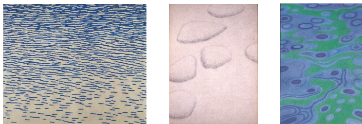
From left: Sazanami (Ripples) (Important Cultural Property), 1932, Nakanoshima Museum of Art, Osaka / Fresh Snow , 1948,