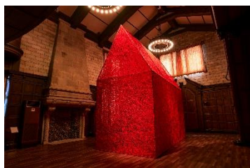
3. Chiharu Shiota, Home to Home , 2022 Installation: metal frame, red wool Kishiwada Jisen Hall, Osaka, Japan Photo Sunhi Mang ©JASPAR, Tokyo, 2024 and Chiharu Shiota