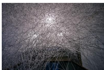
1. Chiharu Shiota, Circulating Memories , 2022 Installation: mixed media Beppu, Oita, Japan Photo Sunhi Mang ©JASPAR, Tokyo, 2024 and Chiharu Shiota