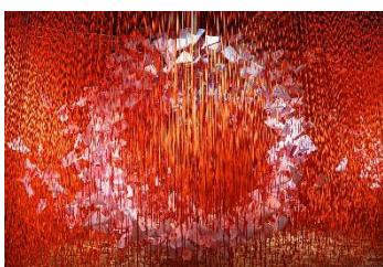
2. Chiharu Shiota, The Eye of the Storm , 2022 Installation: rope, paper BAB 2022 Chaos:Calm, Bangkok Art Biennale, Bangkok, Thailand Photo courtesy Bangkok Art Biennale ©JASPAR, Tokyo, 2024 and Chiharu Shiota