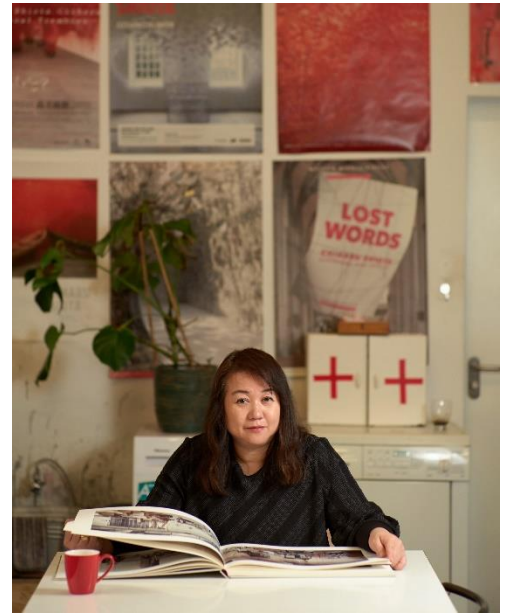
Chiharu Shiota, Berlin, 2023

Holding a solo exhibition like this in my hometown of Osaka feels like a dream come true. The pandemic enabled us to become aware of how we are connected to many people. We are always connected somewhere. Through this show, I hope to inspire visitors to rediscover the connections that surround them.