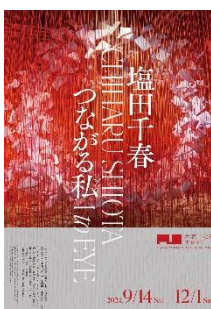
4. Advance leaflet visuals