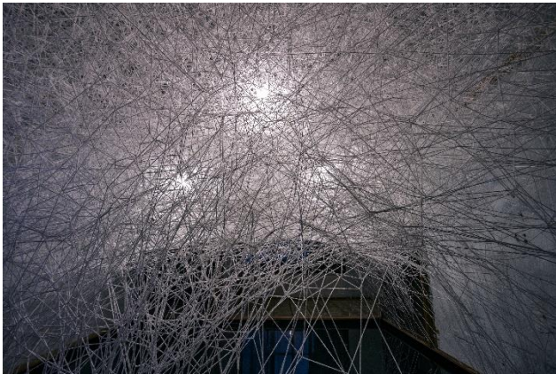
Chiharu Shiota Circulating Memories , 2022 Installation: mixed media Beppu, Oita, Japan Photo Sunhi Mang ©JASPAR, Tokyo, 2024 and Chiharu Shiota

The organizers are currently collecting written texts about "connections," a key theme of the exhibition, from the general public with the objective of showing them in CHIHARU SHIOTA, I to EYE . The artist will use them in an installation as part of the show.